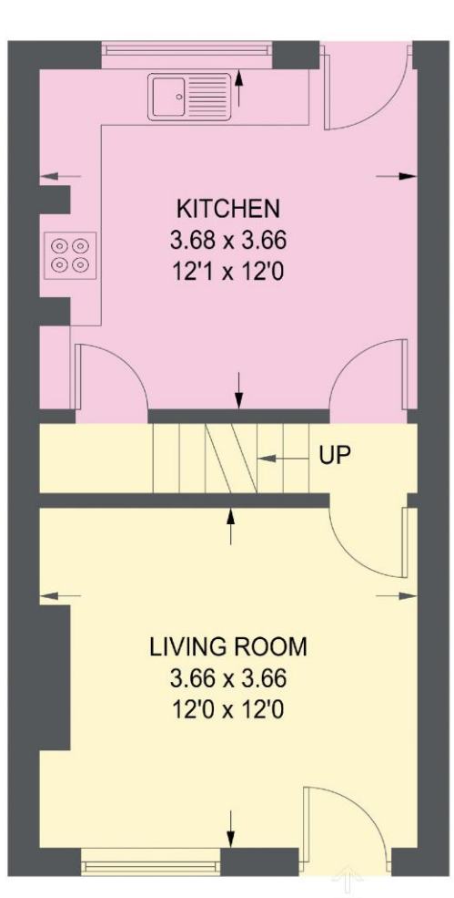
GROUND FLOOR 30.7 SQ M / 330 SQ FT